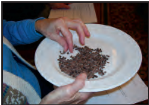
Cocoa nibs (where chocolate begins!)